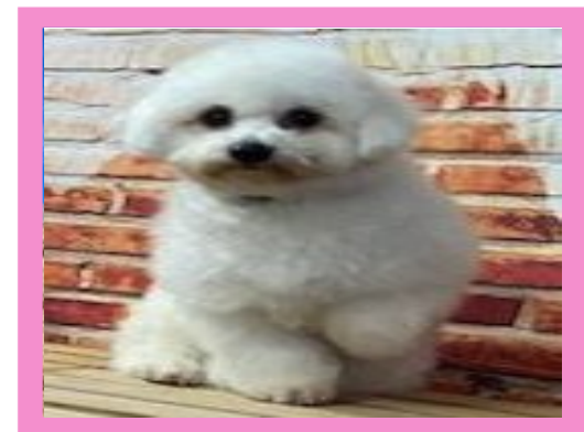
Bon Bon 933000320698205 (Bichon Frise)