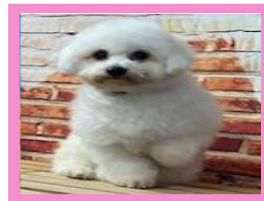
Bon Bon 933000320698205 (Bichon Frise)