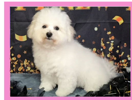
Blossom 933000320432991 (Bichon Frise)