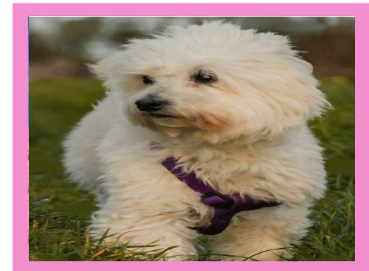
Bellatrix 933000320698220 (Bichon Frise)