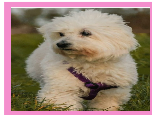
Bellatrix 933000320698220 (Bichon Frise)