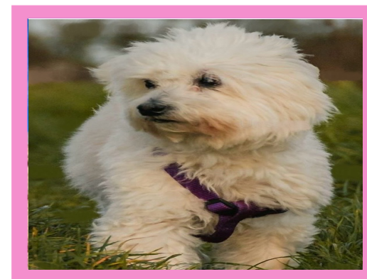
Bellatrix 933000320698220 (Bichon Frise)