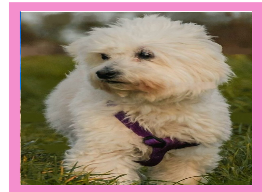
Bellatrix 933000320698220 (Bichon Frise)