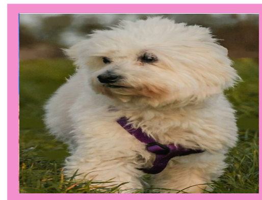
Bellatrix 933000320698220 (Bichon Frise)