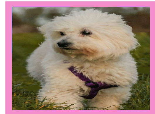
Bellatrix 933000320698220 (Bichon Frise)