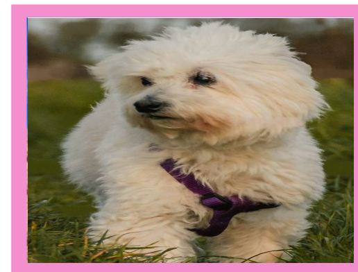
Bellatrix 933000320698220 (Bichon Frise)