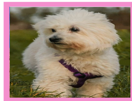
Bellatrix 933000320698220 (Bichon Frise)