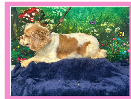
Cookie (Cocker Spaniel)