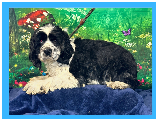
Charlie (Cocker Spaniel)