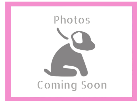
Goldie (Goldendoodle 2nd Gen)