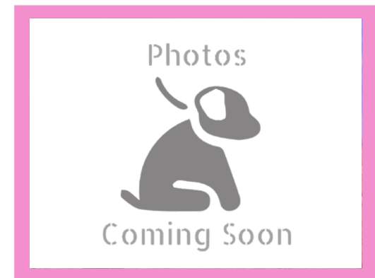
Samantha (Shih Tzu)