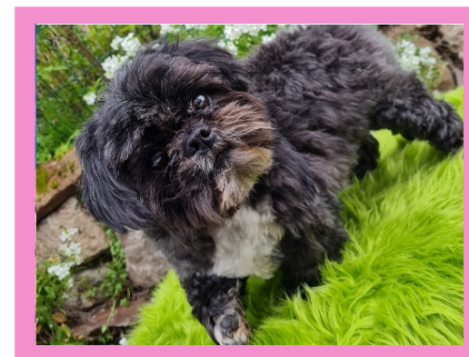
Sarah 933000320698215 (Shih Tzu)