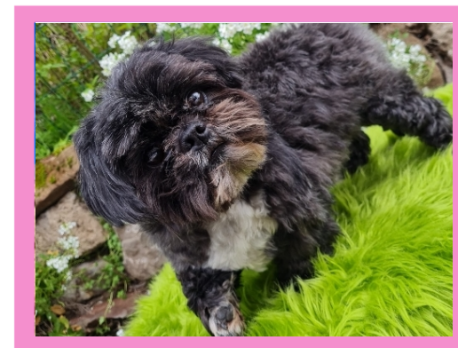
Sarah 933000320698215 (Shih Tzu)