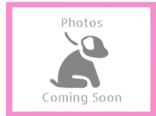
Samantha (Shih Tzu)