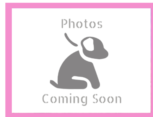
Samantha (Shih Tzu)