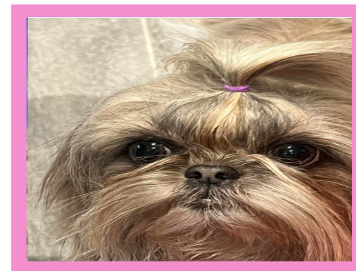
Samantha 93300032069204 (Shih Tzu)