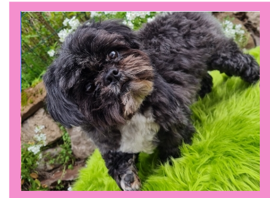
Sarah 933000320698215 (Shih Tzu)