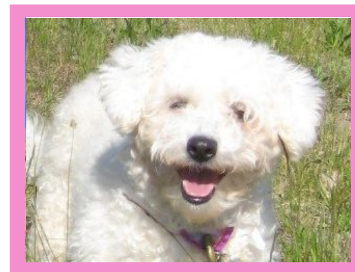
Princess 933000320970375 (Bichon Frise)