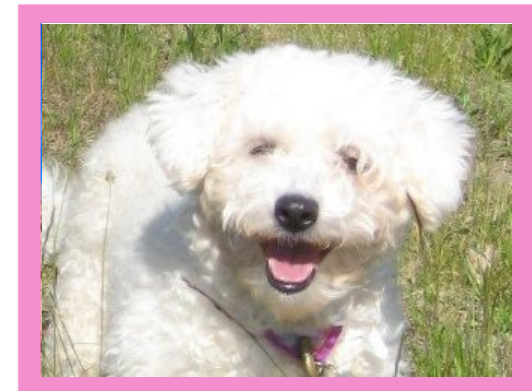
Princess 933000320970375 (Bichon Frise)