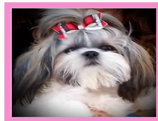
Tabitha (Shih Tzu/Teddy Bear)