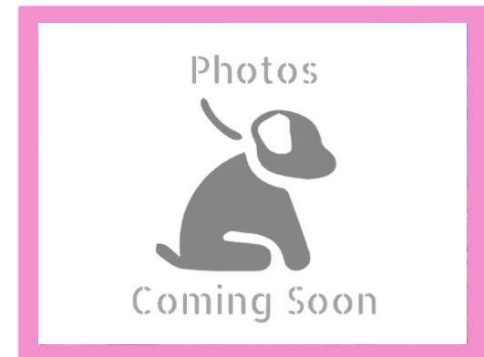
Sarah (Shih Tzu)