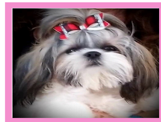
Tabitha (Shih Tzu/Teddy Bear)