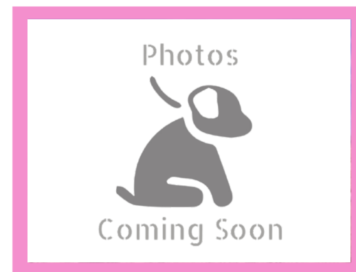
Sarah (Shih Tzu)