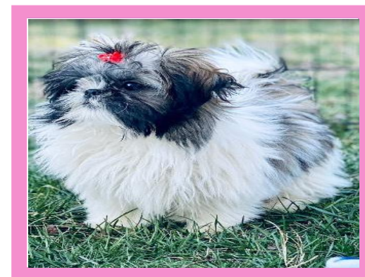
Trisha (Shih Tzu/Teddy Bear)