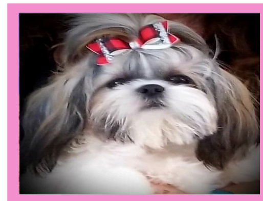
Tabitha-933000320404718 (Shih Tzu/Teddy Bear)