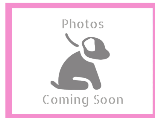
Sarah (Shih Tzu)