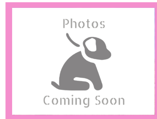
Sarah (Shih Tzu)