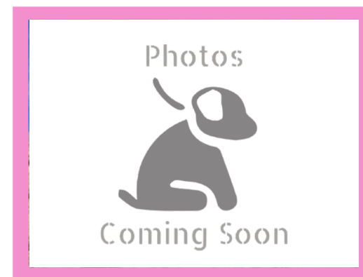
Beatrix 933000320698221 (Bichon Frise)