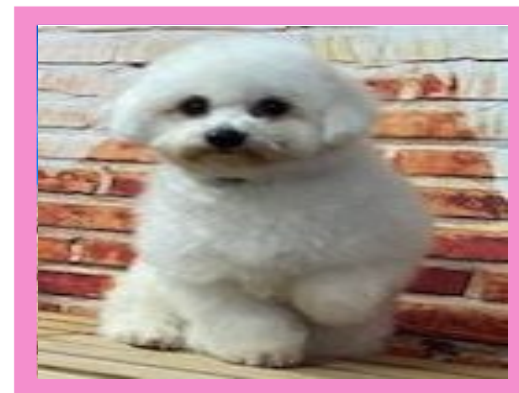
Bon Bon 933000320698205 (Bichon Frise)