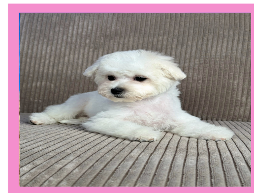
Brandy-933000320970892 (Bichon Frise)